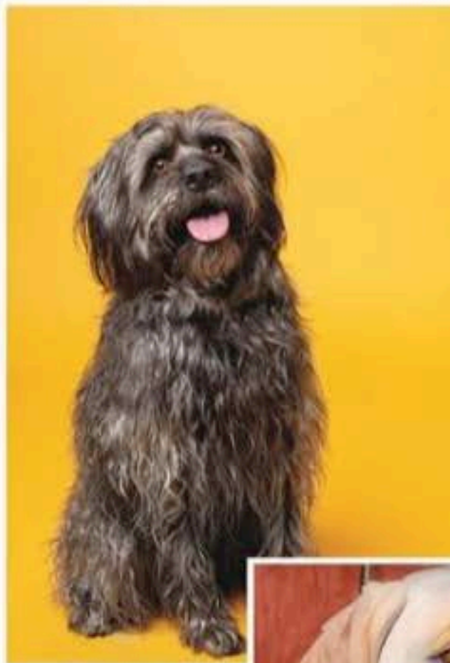
Pet photo sessions with Patty Stefan Photography can be arranged in an outdoor setting or in a studio.